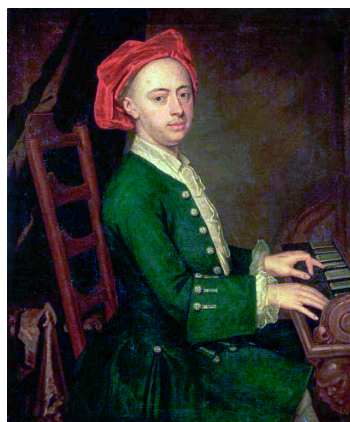
The Chandos portrait of George Frideric Handel by James Thornhill, c. 1720

According to John Mainwaring, an early biographer of Handel, Cardinal Ottoboni arranged a keyboard-playing competition between Handel and Domenico Scarlatti, Alessandro's hyper-talented son. Both prodigies were the same age (born in 1685); both were still in their formative years, and though their styles diverged in later life, they shared many qualities during this Roman period. In their duel, Scarlatti was thought to be a better