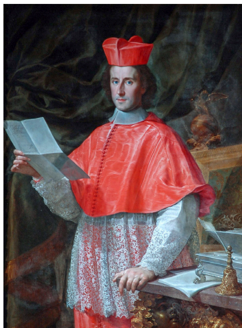
Portrait of Pietro Ottoboni by Francesco Trevisani

The Arcadians required a steady supply of music for their meetings and performances. Due to a somewhat chaotic musical scene in Rome, musicians of the first order were not difficult to encounter. Opera, a still relatively new and evolving art form, was heavily disrupted by a series of challenges from the Vatican. Pope Innocent XI banned opera outright in 1676, only for it to be restored by Alexander VIII in 1689. It was re-prohibited by Innocent XII in 1691. The resulting chaos drove opera from public to private venues. Rome’s wealthy noble class was more than able to accommodate that shift. Cardinal Pietro Ottoboni, for example, built his own theater in his palace, the Palazzo della Cancelleria, after the Teatro di Tor di Nona was decommissioned. Opera-adjacent musical forms—oratorio, cantata, and serenata —began to receive more attention. They required no extravagant machinery, so could be staged in a suitably opulent salon, or even outdoors, rather than in a theater. The Accademia degli Arcadi was perfectly positioned to capitalize on this chaos.