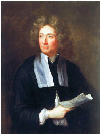
Portrait of Arcangelo Corelli by the Irish painter Hugh Howard (1697)

Corelli was born in 1653 in Fusignano, in the Emilia-Romagna, to a family of deeply unmusical land owners. He quickly discovered the violin and moved in his early teens to study in Bologna. He appeared in Rome in 1675 as a third violinist and began to ascend the ranks. By 1679 he was conducting opera at the Teatro Capranica. His skill as a violinist propelled him to the first rank of musicianship in the city, where he would stay firmly ensconced until his death in 1713. (Corelli's afterlife was no less glorious. He was interred, with Cardinal Ottoboni's help, in the chapel of St. Joseph in the Pantheon.) His first published work was a set of trios published in 1681 dedicated to Queen Christina.